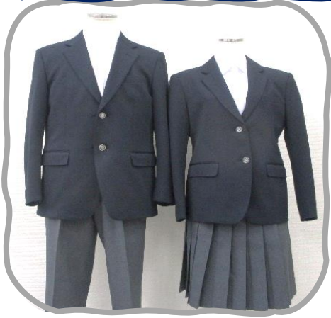
DARK BLUE and GRAY