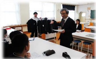
Explanation of the purpose by the chairman↑↑

During the "discussion exchange meeting," the representative students approached the event with keen interest and enthusiasm. There were careful examinations of the combinations of colors, as well as comparisons and considerations between patterns and solids.