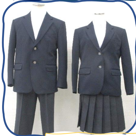
DARK BLUE and CHARCOAL GRAY